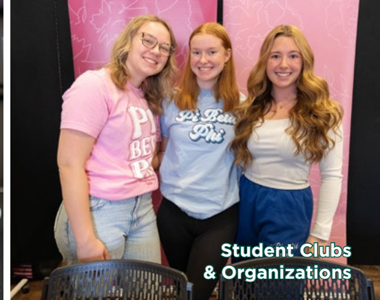
Student Clubs & Organizations