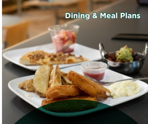
Dining & Meal Plans