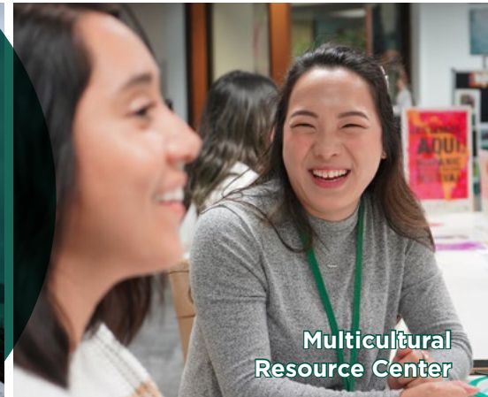
Multicultural Resource Center